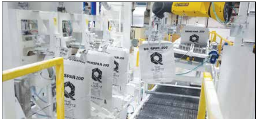
Three Model A Valve Bag Fillers with Robotic Bag Placing for packing of 50 lb. bags.