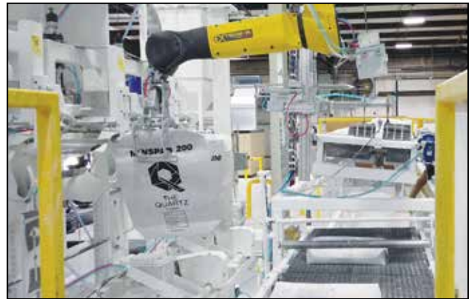
Model TRV1000 robot placing 50 lb. bags for filling and conveying.