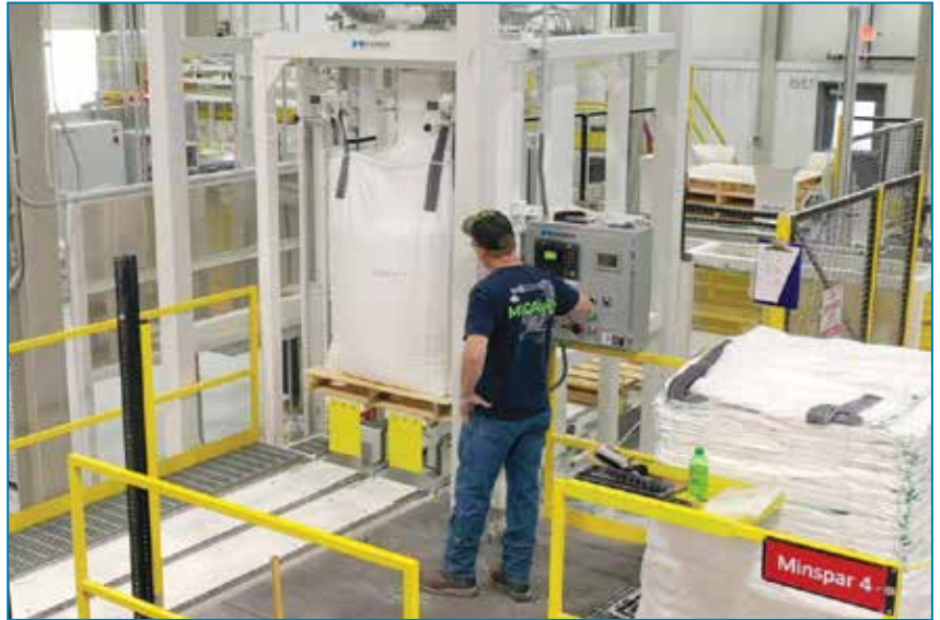
Model IBC3000 filling and weighing 1,000 and 2,000 lb. bulk bags at The Quartz Corporation.

Magnum Systems provided a complete control package for the automation of the conveyors. Including several HMIs for operator interface and safety interlocks.