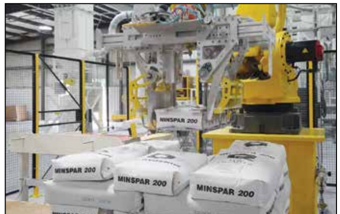
Model TRP3000 robotic palletizing 50 lb. bags to be shrink wrapped for delivery.

Your Integrated Source for Bulk Material Automation.