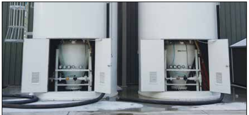
Dense phase transporters in the silo skirts supply the minerals through the total system solution at The Quartz Corporation.