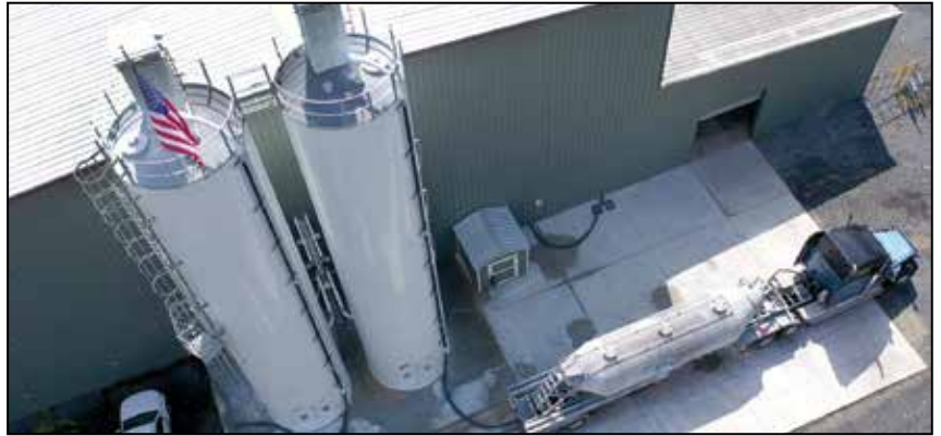
Magnum Systems provided two silos for the storage of mineral products.